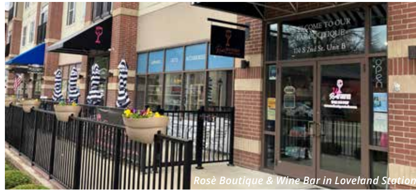
Rosé Boutique & Wine Bar in Loveland Station