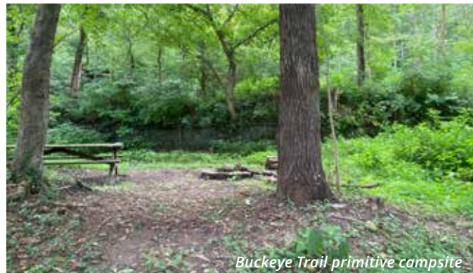
Buckeye Trail primitive campsite

The 26.5-acre West Loveland Nature Preserve (formerly known as Hidden Creek) offers two trails within a creek valley. One trail follows the creek, and the second trail crosses the creek.