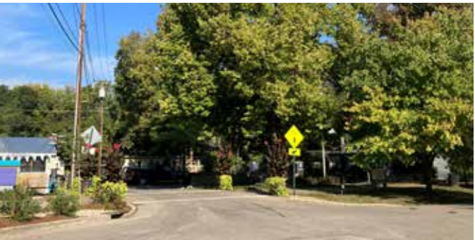
For safety, Harrison Avenue will be widened to improve road and parking lot access.

Additionally, Harrison will be realigned to the north by approximately 70 feet to improve road and parking lot access. The wider road will improve the turning radius from North Karl Brown Way.