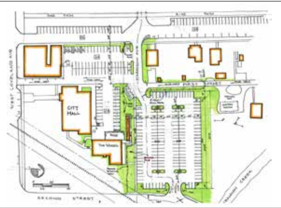
Surface parking lot layout

The lot will create a new access point into downtown from State Route 48. Additionally, the lot will include lighting, landscaping, and a pedestrian path. Once a bid contract is approved by City Council, demo will begin. The lot is anticipated to be done by mid-2024.