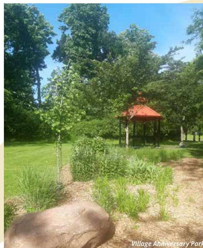
Village Anniversary Park

The park's gazebo has been freshly painted. There is a newly established and growing pollinator garden. See how many different butterflies, bees, and birds you can find!