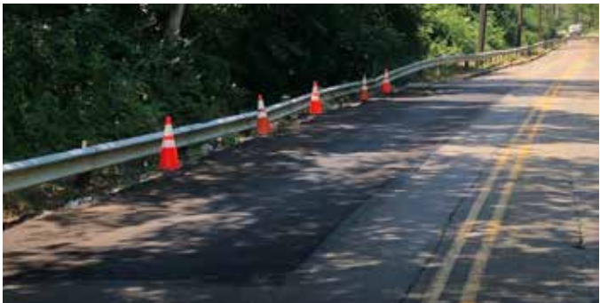
Upper: Riverside Drive curb drainage at area prone to flooding. Lower: Failed pavement patch on East Kemper Road.