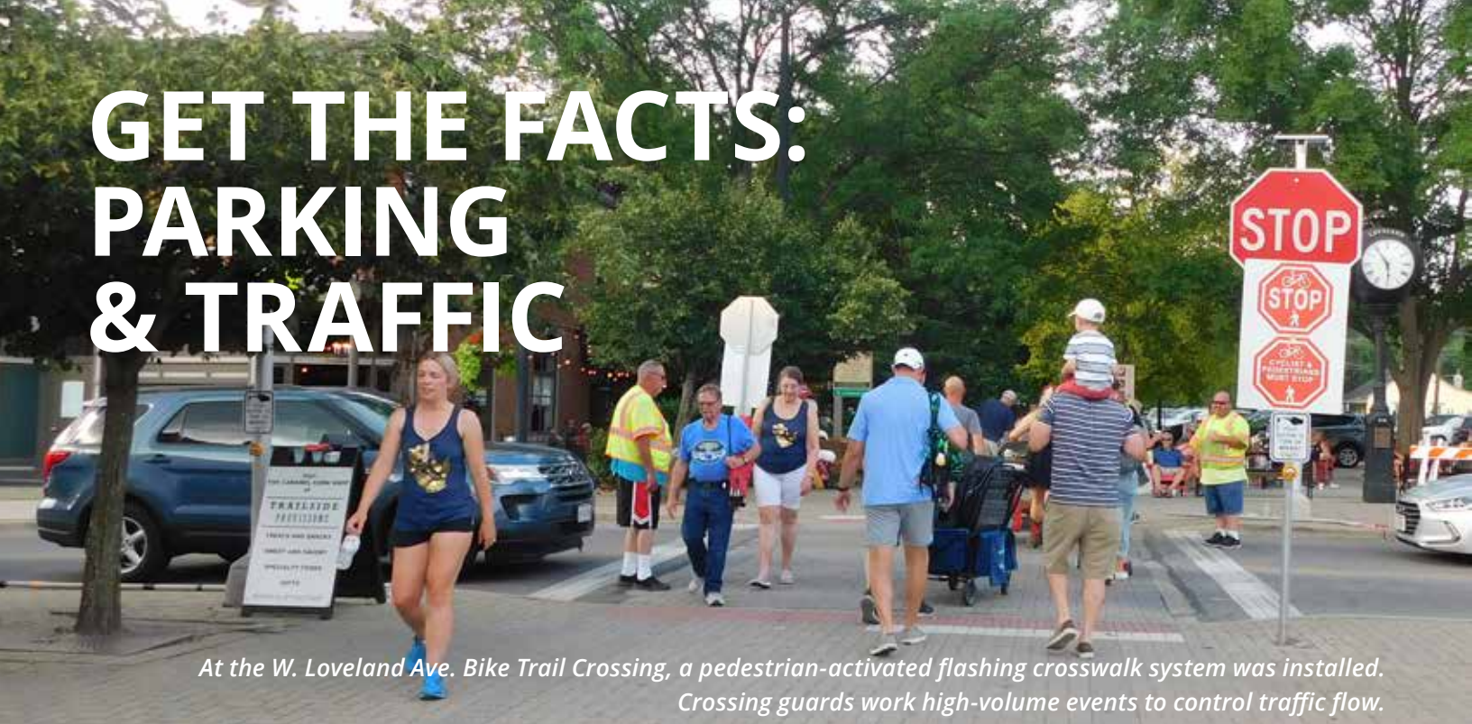
At the W. Loveland Ave. Bike Trail Crossing, a pedestrian-activated flashing crosswalk system was installed. Crossing guards work high-volume events to control traffic flow.

“What is the city doing about traffic and parking?”