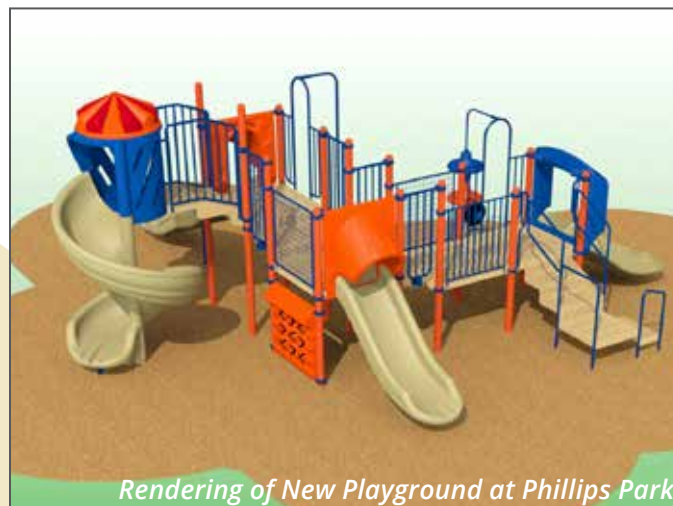
Rendering of New Playground at Phillips Park

A patio seating area is being constructed in Downtown Loveland, thanks to a Hamilton County Community Development Block Grant that supports outdoor dining. The area will feature a concrete/brick patio, tables, chairs, and a waste/recycling station.