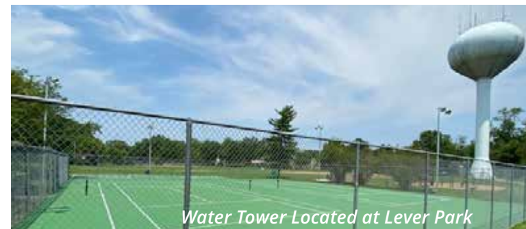
Water Tower Located at Lever Park

The 2022 budget includes funds to clean the exteriors of three of the city’s elevated water storage towers located at Union Cemetery Road, Commerce Dr., and Lever Park. Cleaning will take place as weather allows since temperatures are required to be over 50 degrees and winds must be low.