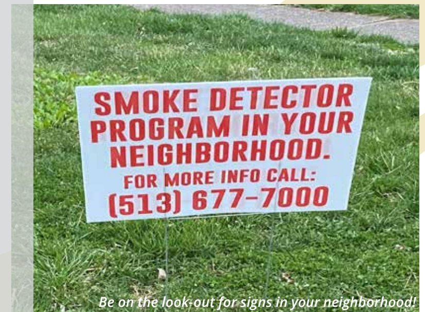
Be on the look-out for signs in your neighborhood!

The city's Building Official is now holding regular office hours at City Hall on Tuesdays and Thursdays from 11 a.m. to 1 p.m. to answer questions you may have about planned or future projects.