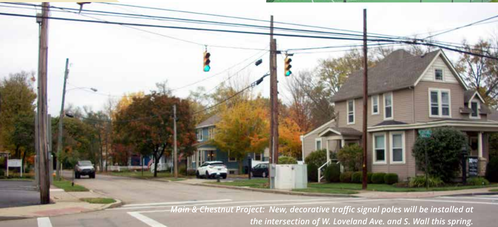
Main & Chestnut Project: New, decorative traffic signal poles will be installed at the intersection of W. Loveland Ave. and S. Wall this spring.