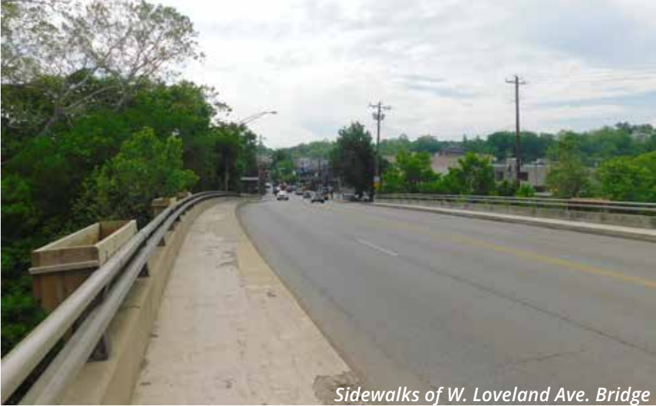
Sidewalks of W. Loveland Ave. Bridge