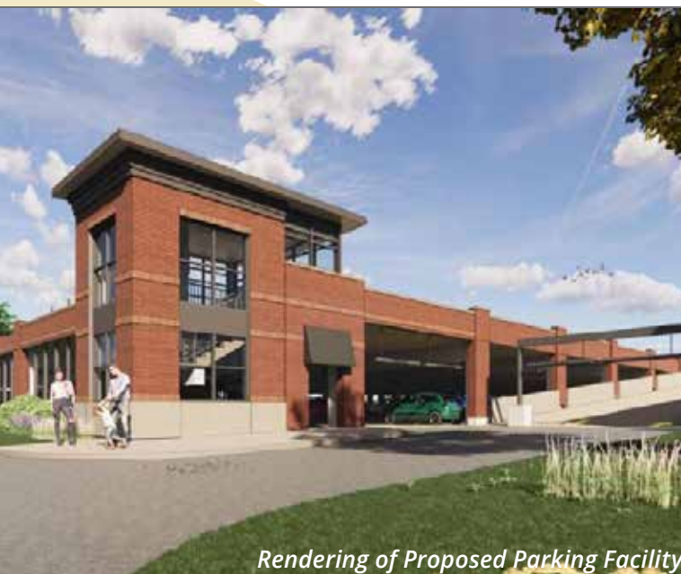
Rendering of Proposed Parking Facility