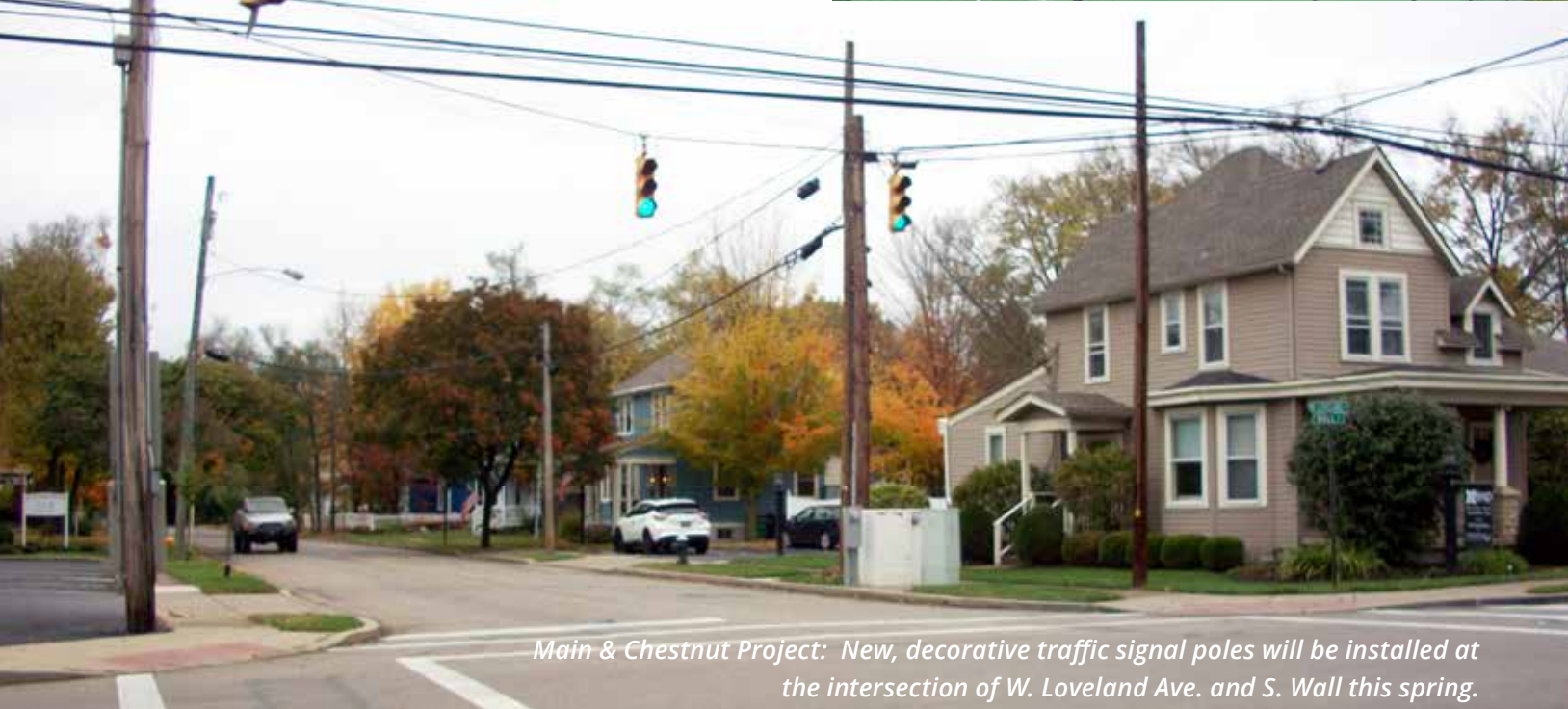
Main & Chestnut Project: New, decorative traffic signal poles will be installed at the intersection of W. Loveland Ave. and S. Wall this spring.