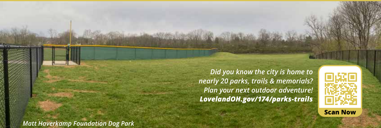
Matt Haverkamp Foundation Dog Park

Did you know the city is home to nearly 20 parks, trails & memorials? Plan your next outdoor adventure! LovelandOH.gov/174/parks-trails