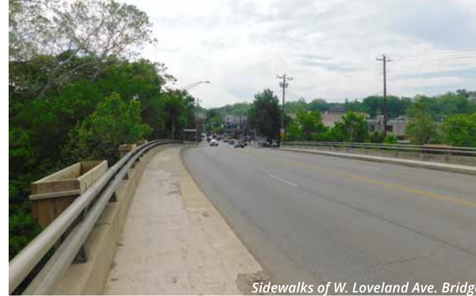
Sidewalks of W. Loveland Ave. Bridge