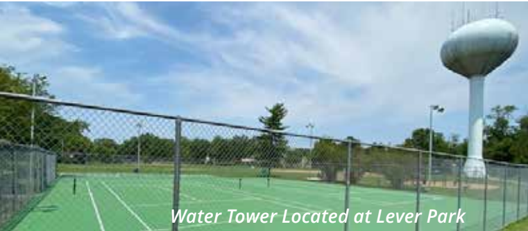
Water Tower Located at Lever Park

The 2022 budget includes funds to clean the exteriors of three of the city’s elevated water storage towers located at Union Cemetery Road, Commerce Dr., and Lever Park. Cleaning will take place as weather allows since temperatures are required to be over 50 degrees and winds must be low.