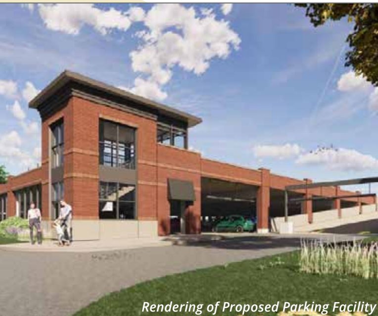
Rendering of Proposed Parking Facility