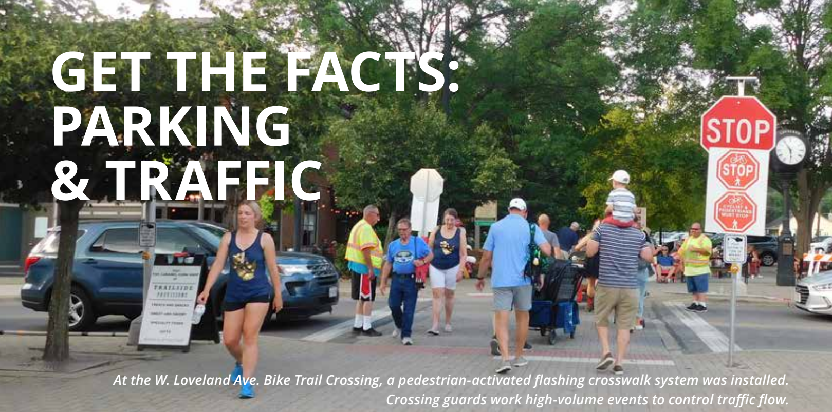
At the W. Loveland Ave. Bike Trail Crossing, a pedestrian-activated flashing crosswalk system was installed. Crossing guards work high-volume events to control traffic flow.

“What is the city doing about traffic and parking?”